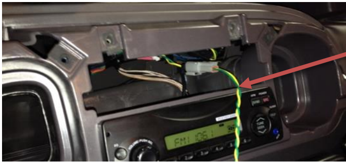
Odyne supplied CAN harness

The information in Technical Service Bulletins is intended for use by trained, professional technicians with the knowledge, tools, and equipment to do the job properly and safely. It informs these technicians of conditions that may occur on some vehicles, or provides information that could assist in proper vehicle service. Warranty Policy documentation determines Warranty coverage unless stated otherwise in the TSB article. The information in this Technical Service Bulletin (TSB) was current at the time of printing. Odyne Systems, LLC reserves the right to supersede this information with updates. The most recent information is available through Odyne on-line technical resources.